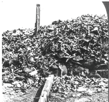
A hill of human remains

The Book which is 800 pages will be available soon. Pre-orders will be available through the YHA in the next issue.