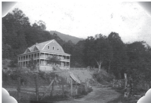
Dolph Wilson's Hotel, located across the road from Black Mountain Railway's Murchison Depot.